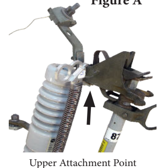
Upper Attachment Point