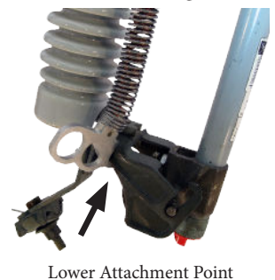
Lower Attachment Point