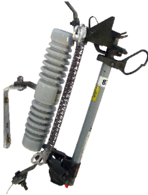
USJJ-006 27kV SMD-20 Cutout Bypass Tool 27kV S9CMU Fuse Bypass Tool