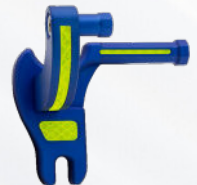
USSA-QGP-PWR-F Quick Grab Power Fuzzy Finger Probe