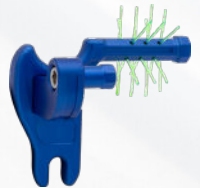
USSA-QGP-FFP Quick Grab Fuzzy Finger Probe