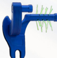
USSA-QGP-PWR-FFP Quick Grab Power Fuzzy Finger Probe