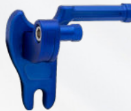
USSA-QGP Quick Grab Probe