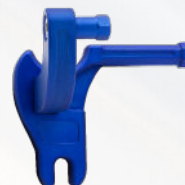
USSA-QGP-PWR Quick Grab Power Probe