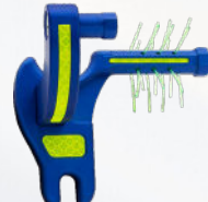
USSA-QGP-PWR-FFP-F Hi-Visibility Quick Grab Power Fuzzy Finger Probe