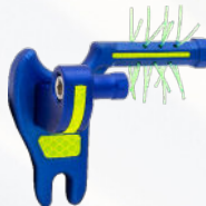
USSA-QGP-FFP-F Hi-Visibility Quick Grab Fuzzy Finger Probe