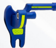
USSA-QGP-F Hi-Visibility Quick Grab Probe